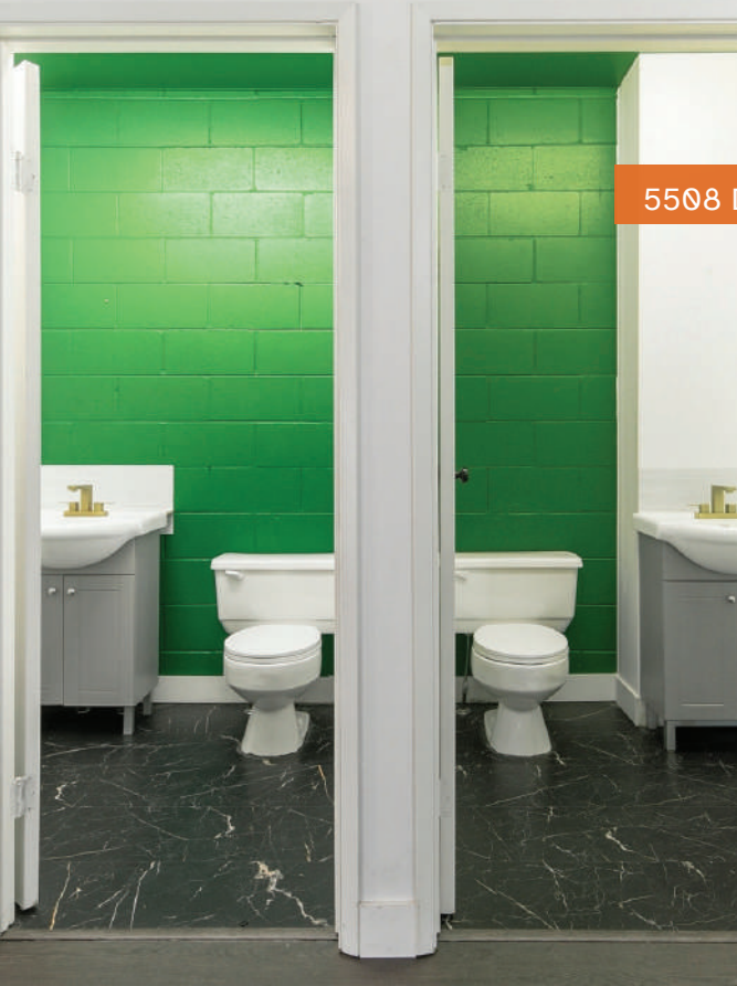
5508 Dorset St