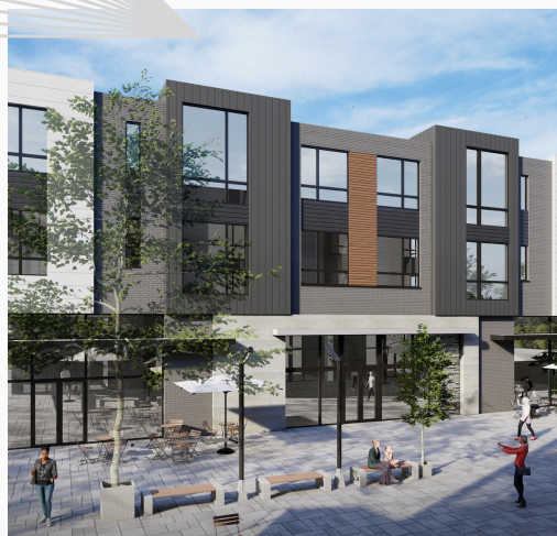
Prime Retail Space