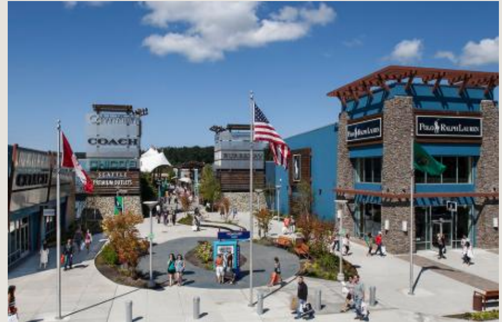
Seattle Premium Outlets