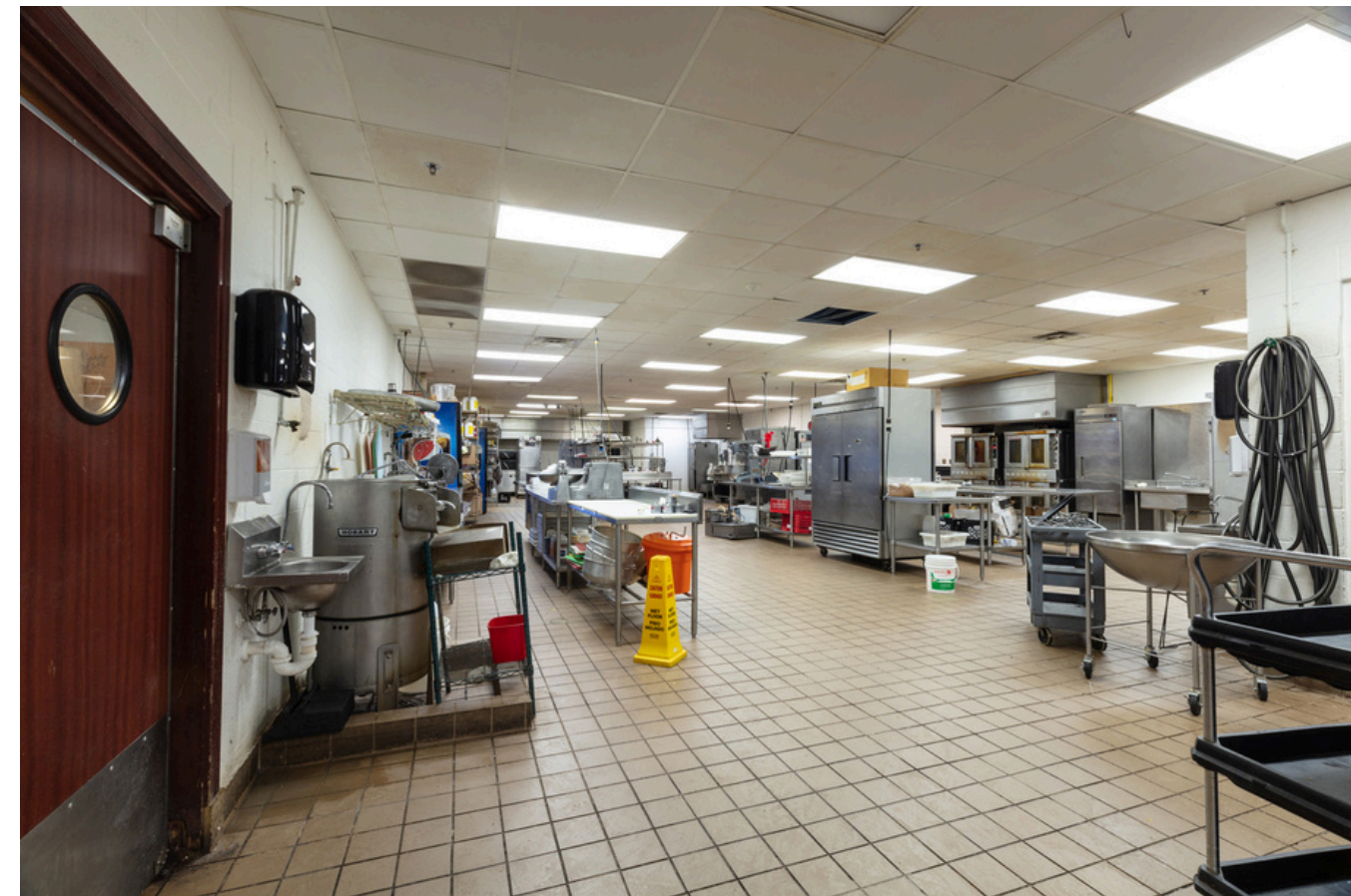
Kitchen & Back-of-House Photos