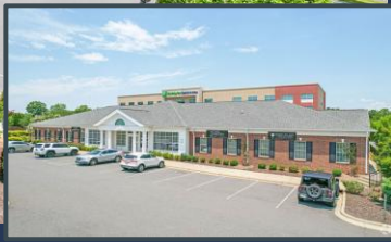
Off Baxter Fort Mill