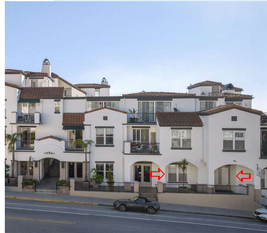
428 POLI STREET, Unit 2C