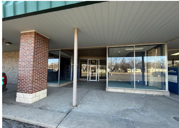
920 S. Oliver