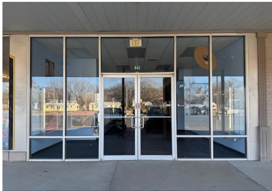
942 S. Oliver