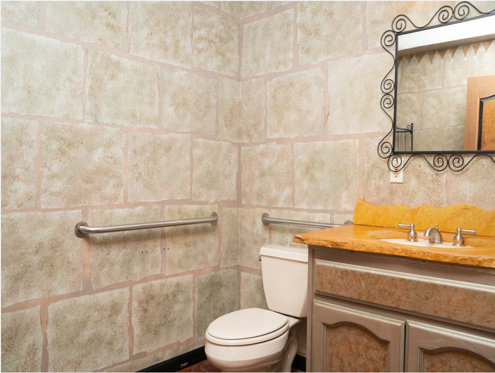
Basement Office Bathroom