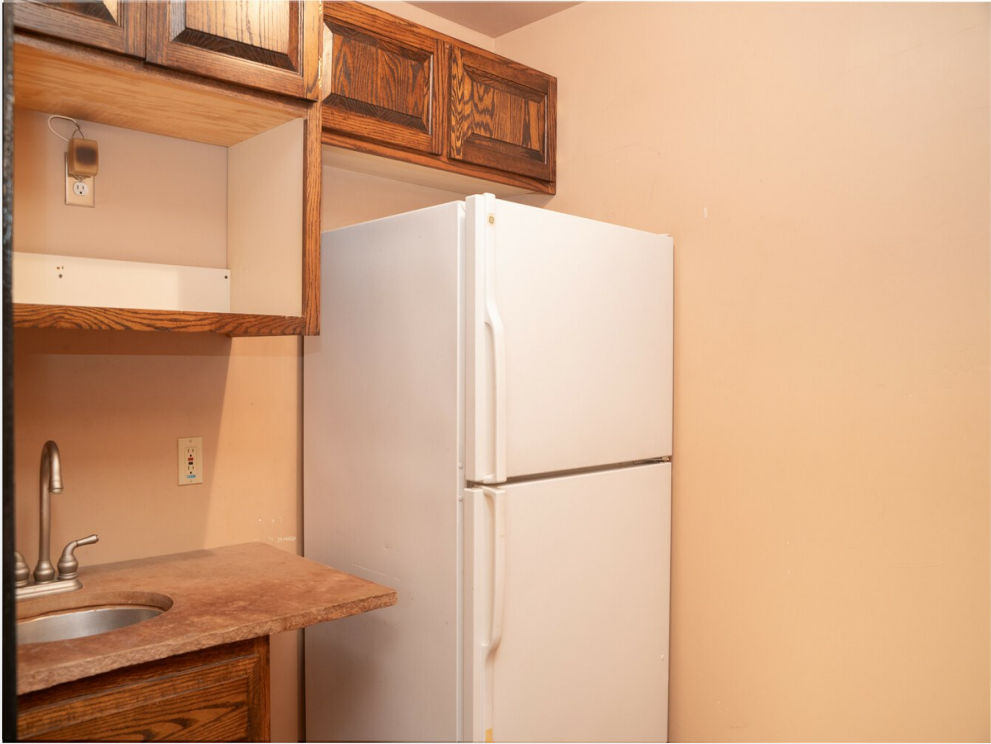
Basement Office Break Room