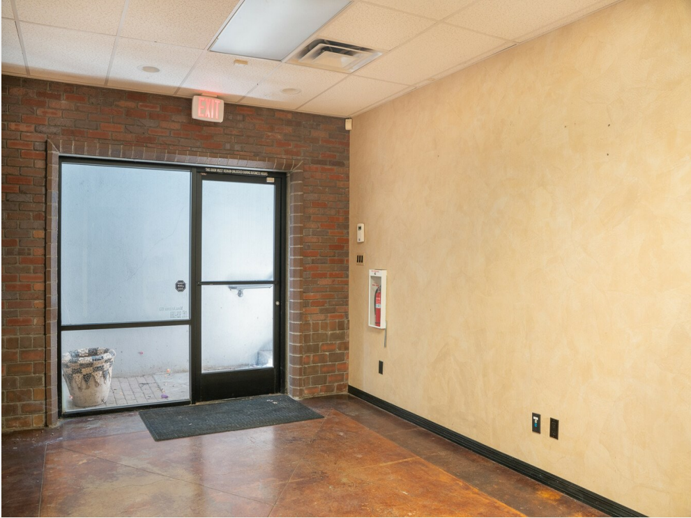
Basement Office Entrance