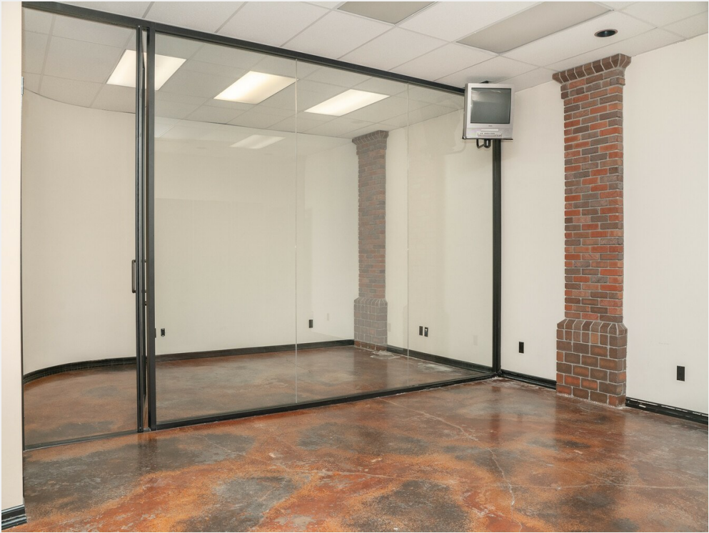
Basement Office Conference