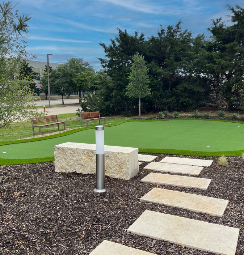
PUTTING GREEN AND SEATING