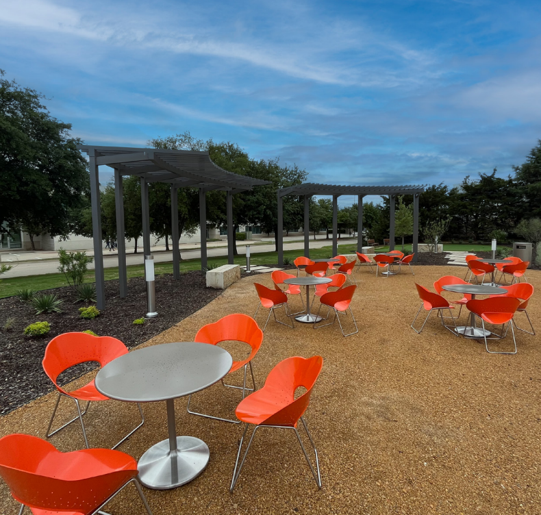
OUTDOOR SEATING AND TRELLIS