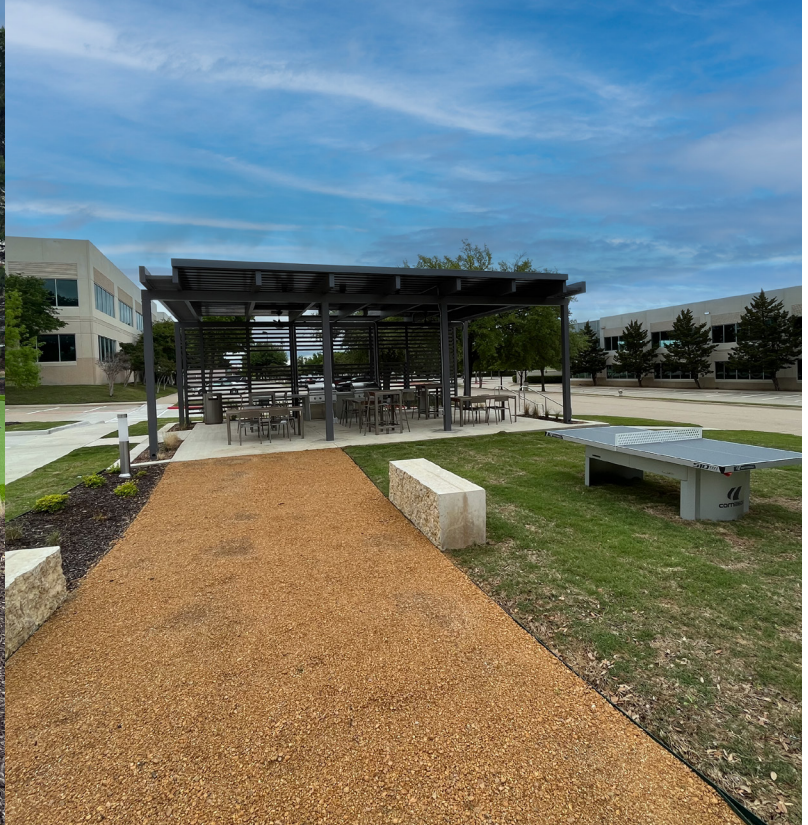
OUTDOOR KITCHEN WITH PING PONG