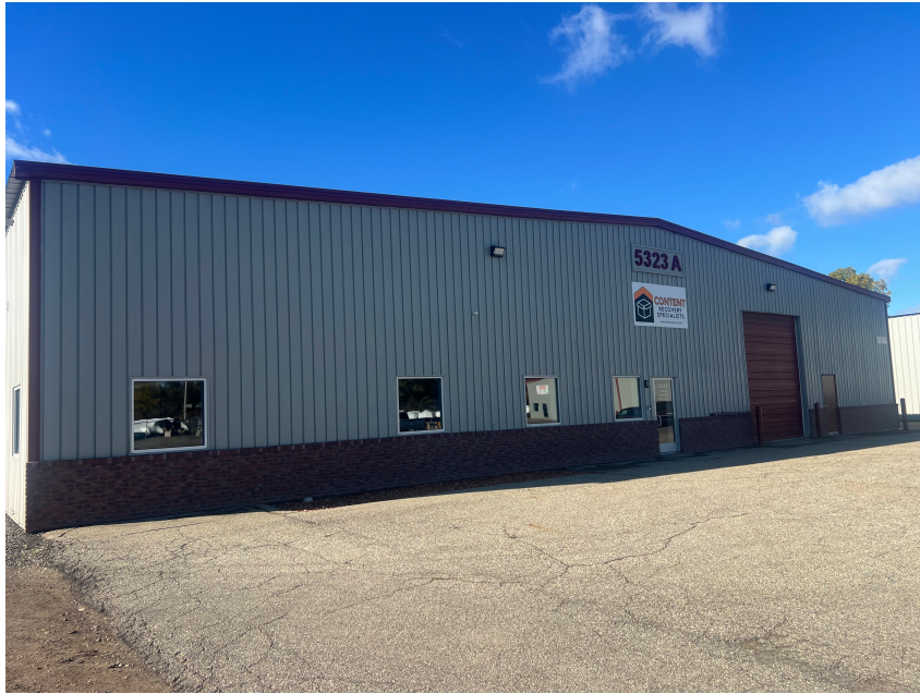
Dixie Commercial 5323 A Dixie, Waterford Township, MI 48329