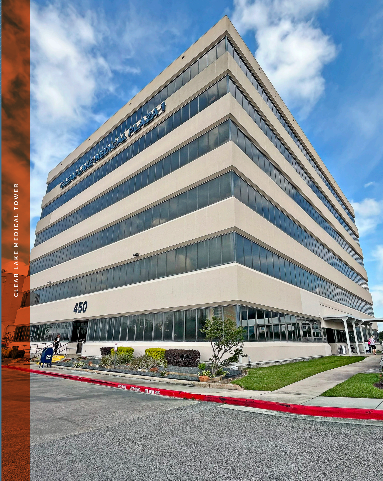
CLEAR LAKE MEDICAL TOWER