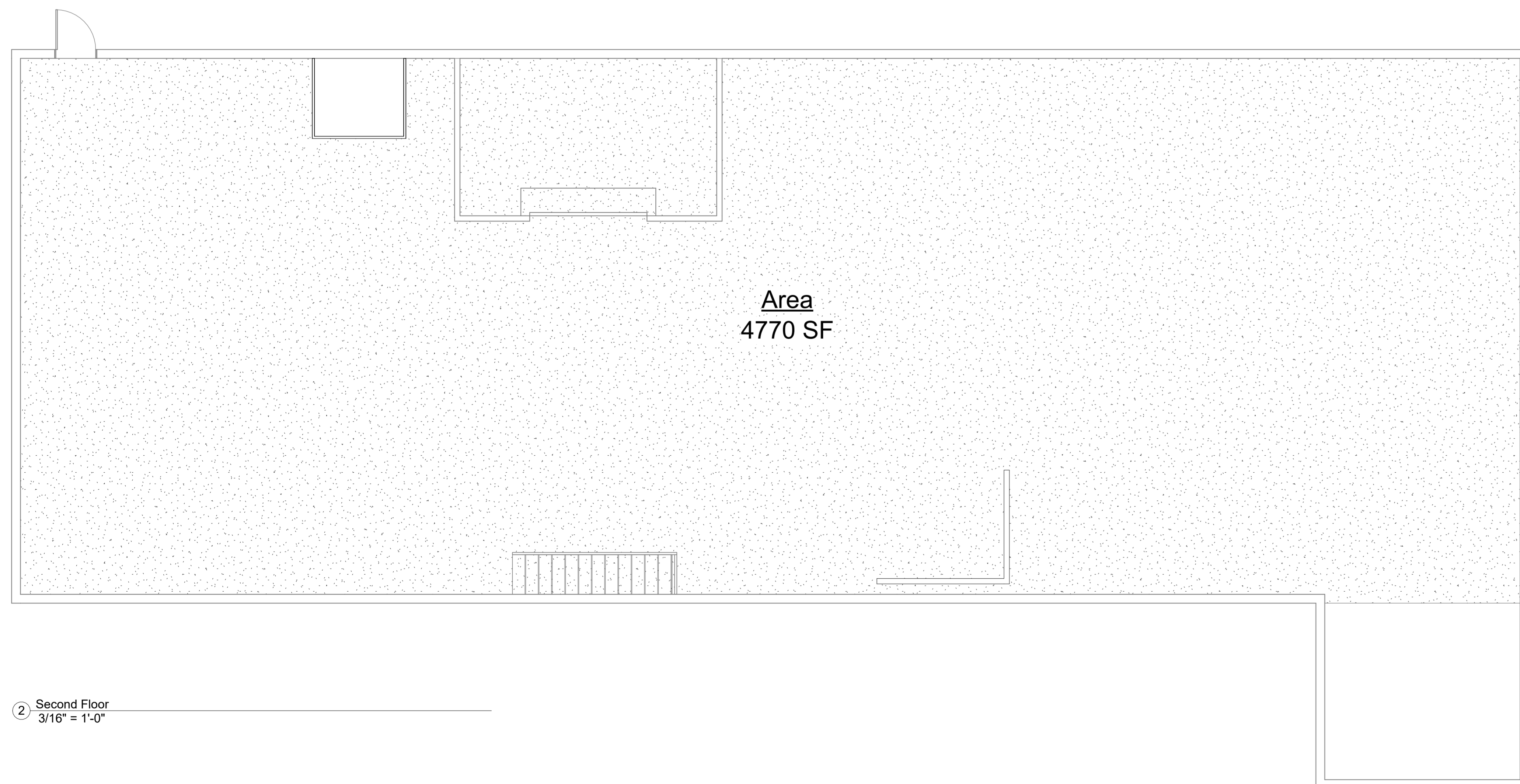
② Second Floor 3/16" = 1'-0"