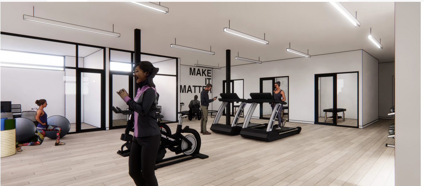
OFFICES / PATIENT ROOMS