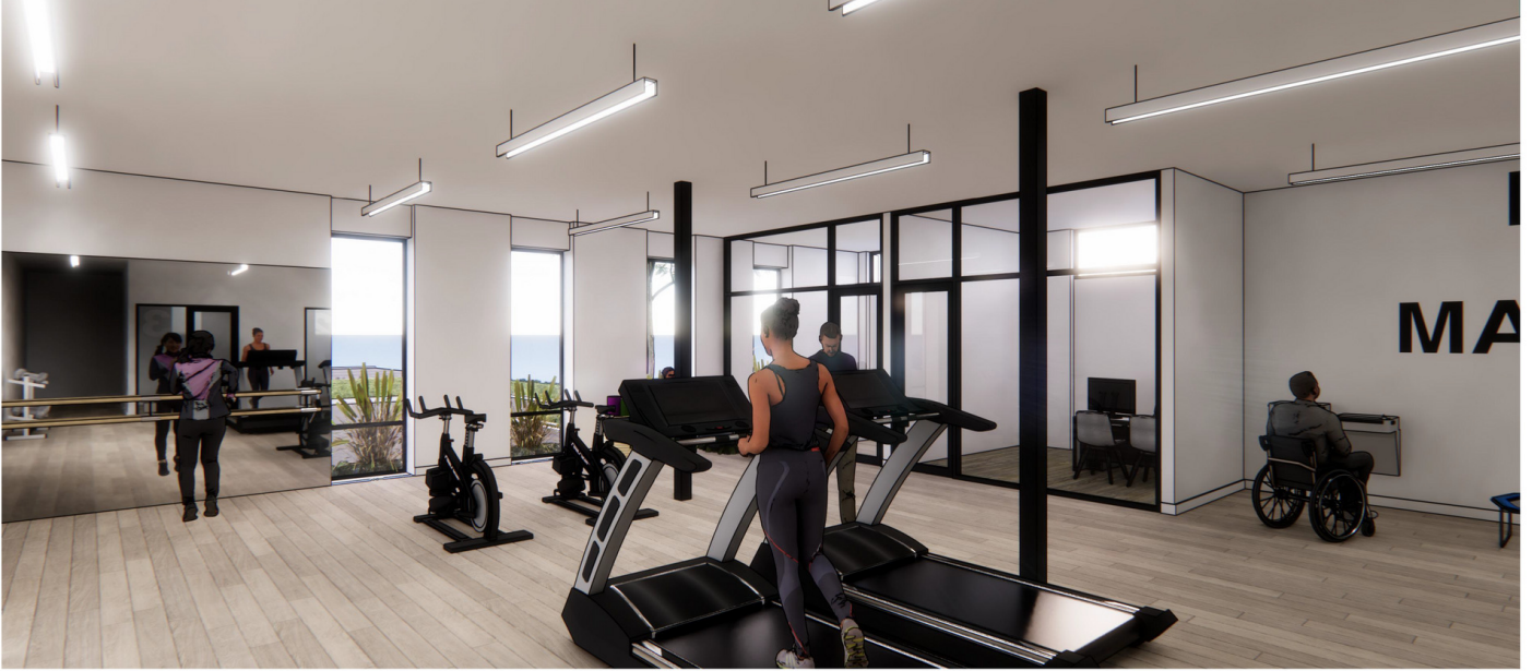
OPEN OFFICE / GYM