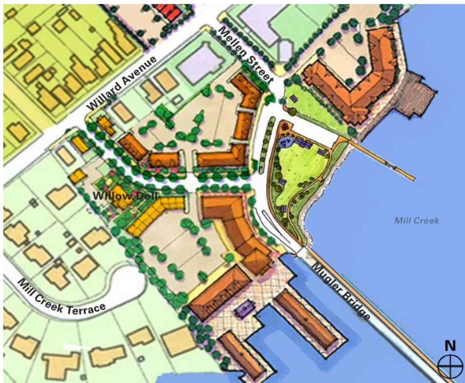
LONG TERM VISION PLAN Potential build-out

Phoebus Master Plan by Urban Design Associates