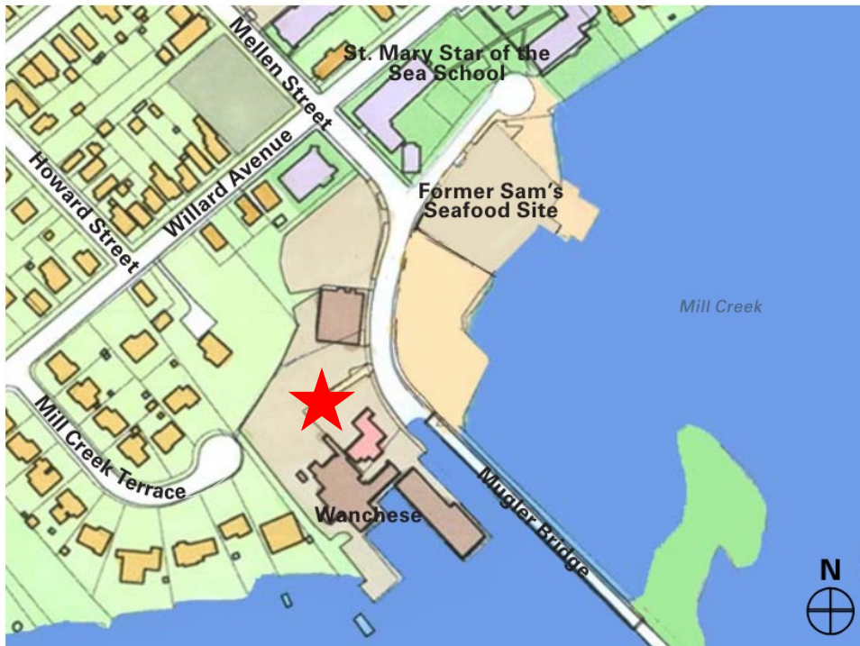
Portrait of existing conditions