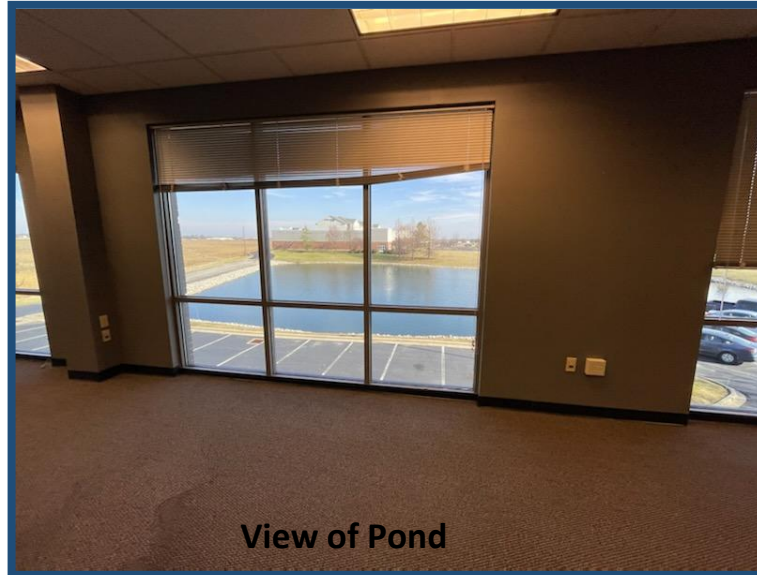
View of Pond