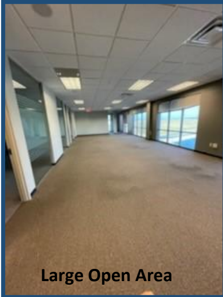
Large Open Area

Class A Office Space 303 Fountains Parkway Fairview Heights, Illinois 62208