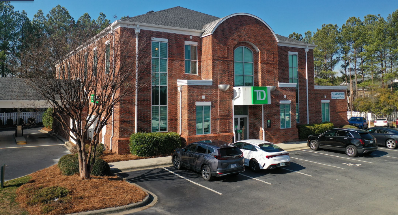
Stone Village Park

TRAFFIC COUNT: 31,200 AADT on SC Highway 160