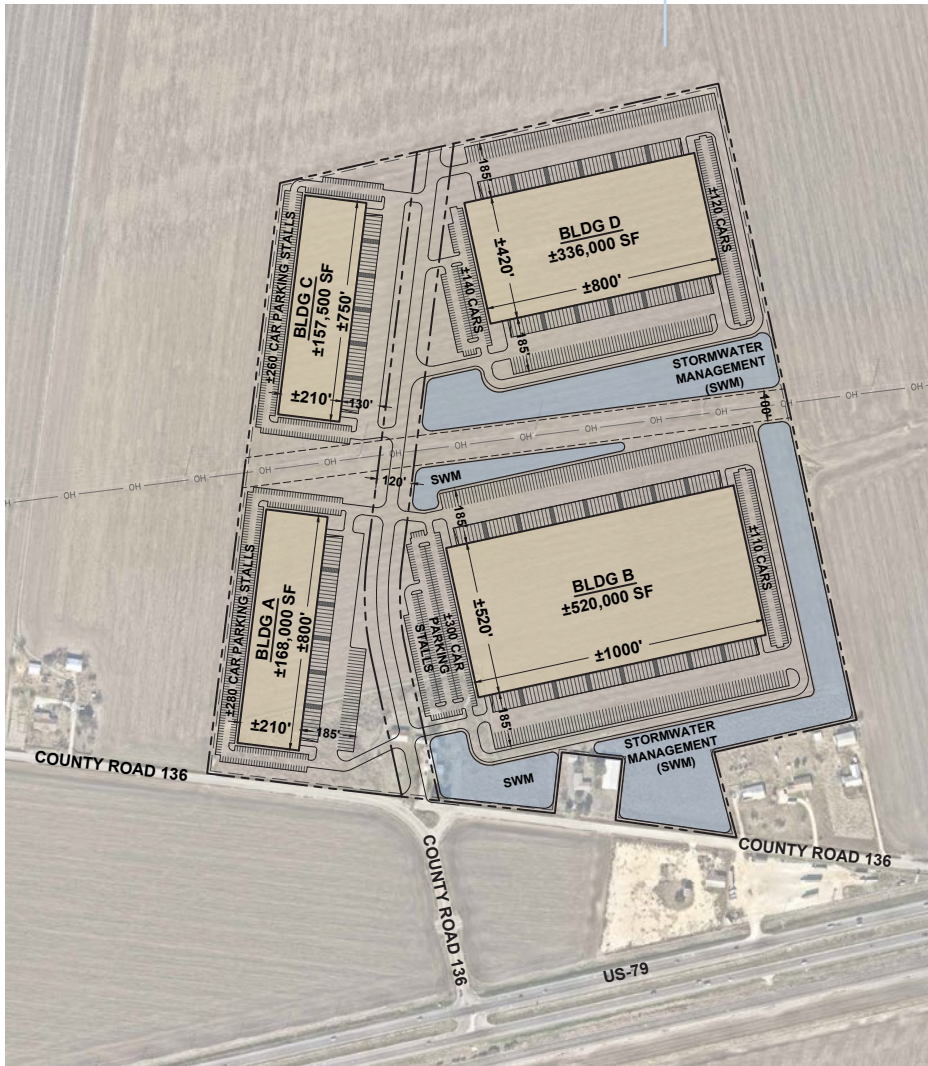
Potential Site Plan