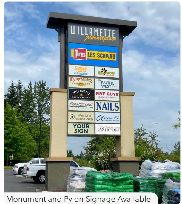
Monument and Pylon Signage Available