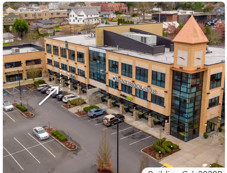
Building C | 2020B