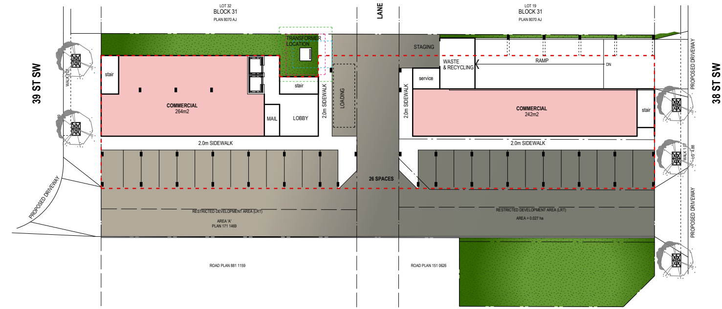
SITE/MAIN FLOOR PLAN SCALE: 1 : 250 FLOOR AREA: 644.65m 2