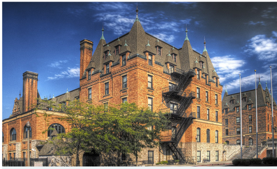
STADIUM HIGH SCHOOL