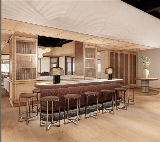
Tenant Amenity Lounge