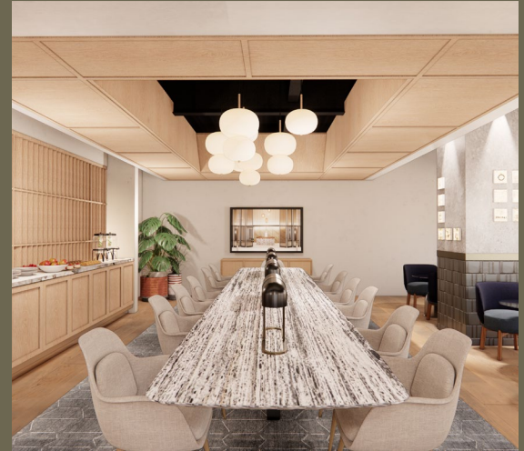
Building Conference Center