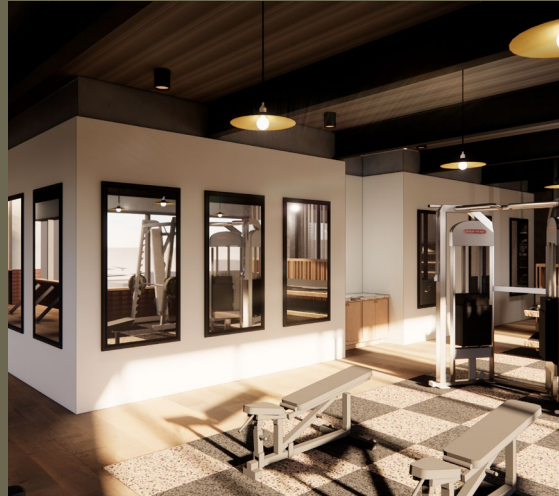
Brand New Class A Fitness Center