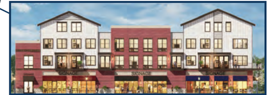
BUILDING 2 RENDERING