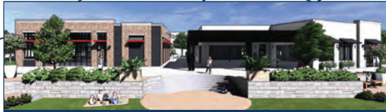
BUILDINGS 3 & 4 RENDERING