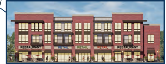
BUILDING 1 RENDERING