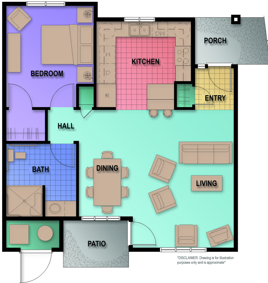
1 Bedroom 1 Bathroom 870 SF Floor Plan