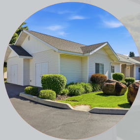
BARRIER FREE DESIGN