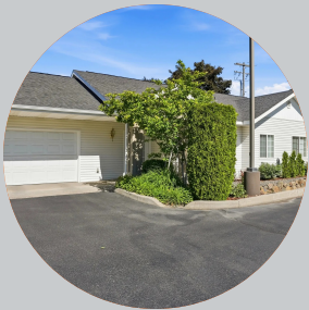
0% VACANCY SINCE 2020