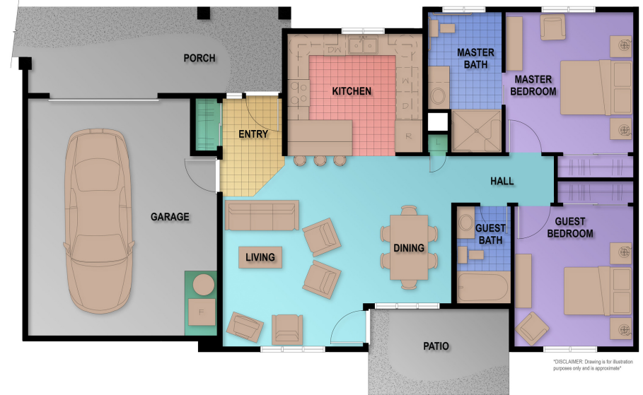
2 Bedroom 2 Bathroom 1,170 SF Floor Plan