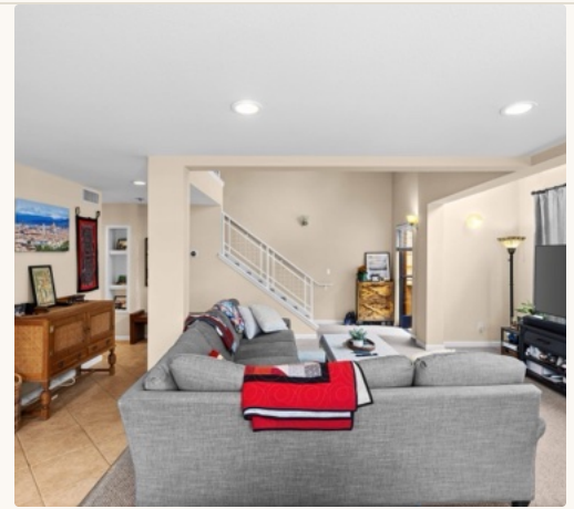
03 RESIDENTIAL — LIVING, UNIT 201