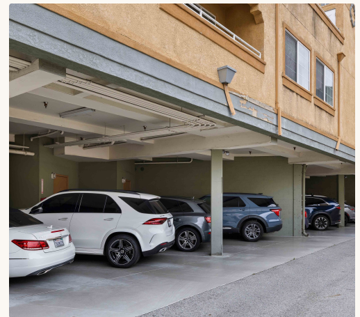
09 COVERED CARPORT