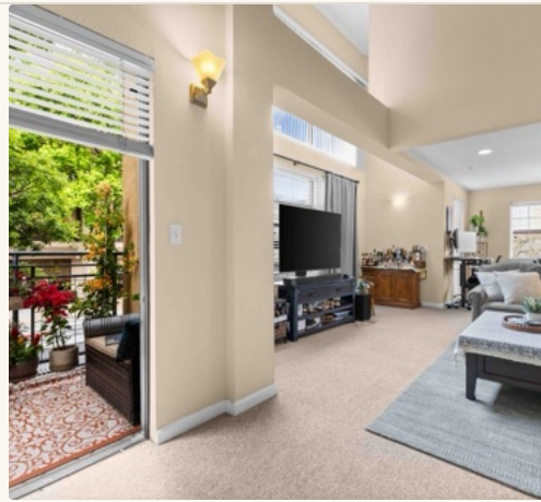
02 RESIDENTIAL — LIVING, UNIT 201