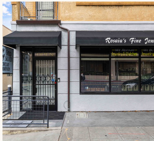
08 GROUND-FLOOR RETAIL