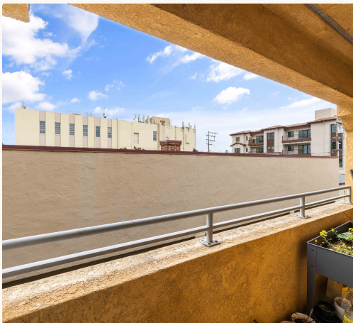
07 PRIVATE BALCONY