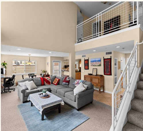
04 TWO-STORY LIVING + LOFT