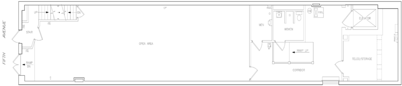
822 Fifth Avenue - First Floor