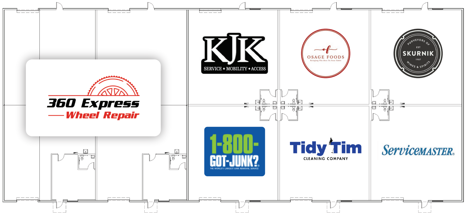
OVERALL FLOOR PLAN