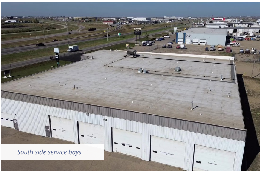
South side service bays