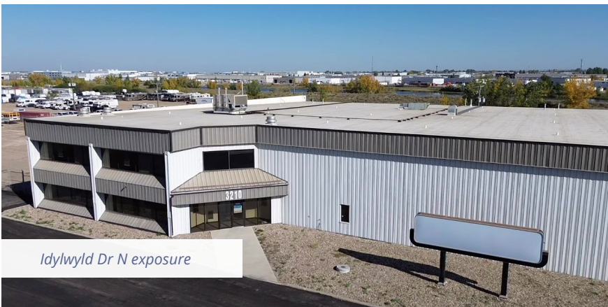
Idylwyld Dr N exposure