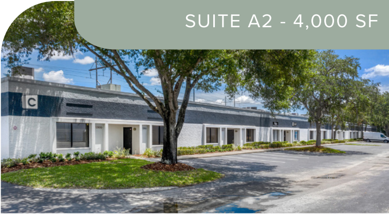
SUITE A2 - 4,000 SF

112704-12706 DUPONT CIRCLE, SUITE A2 | TAMPA, FL 33626