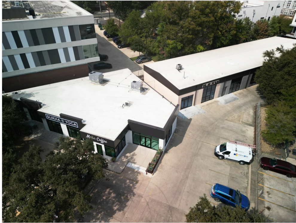
Aerial View B