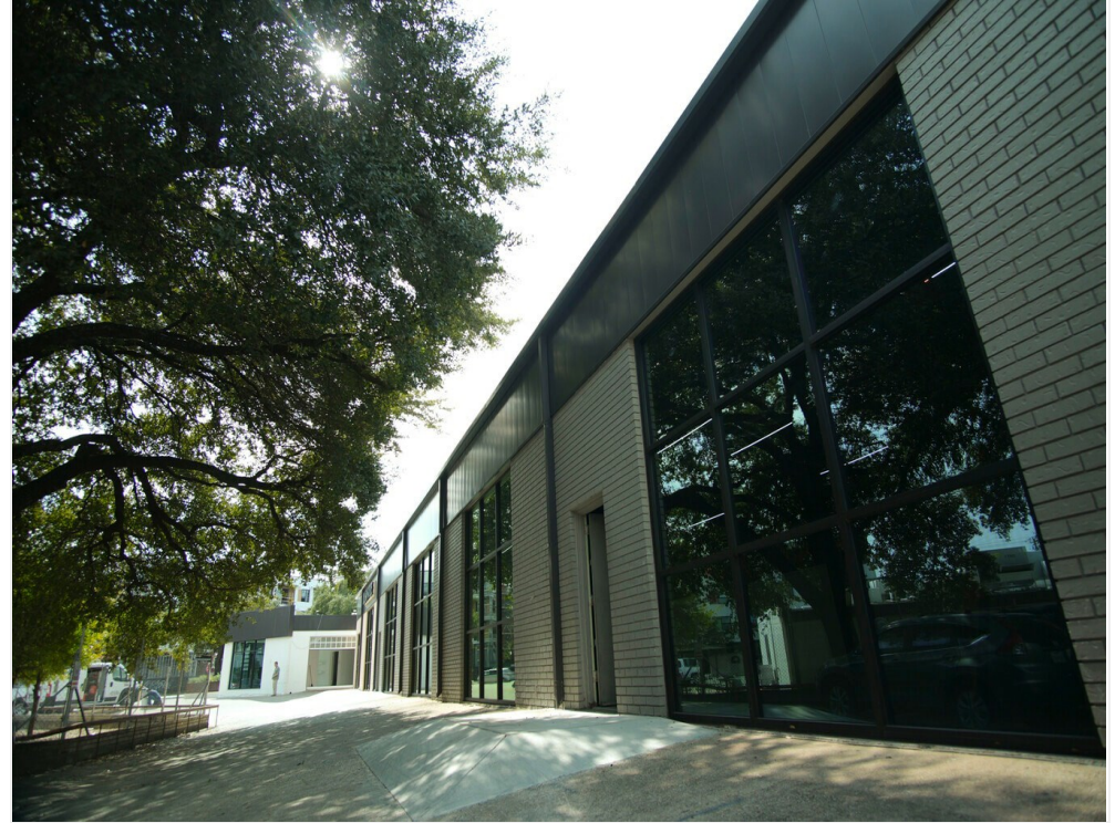
Evergreen Back units