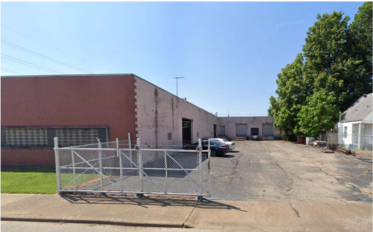
Great Location convenient to Business & Government Buildings