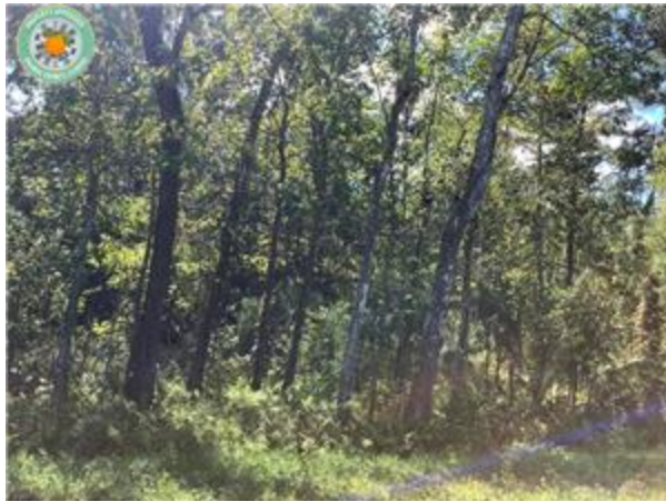
15656 E COLONIAL DR, ORLANDO, FL 32820 10/12/2020 1:16 PM