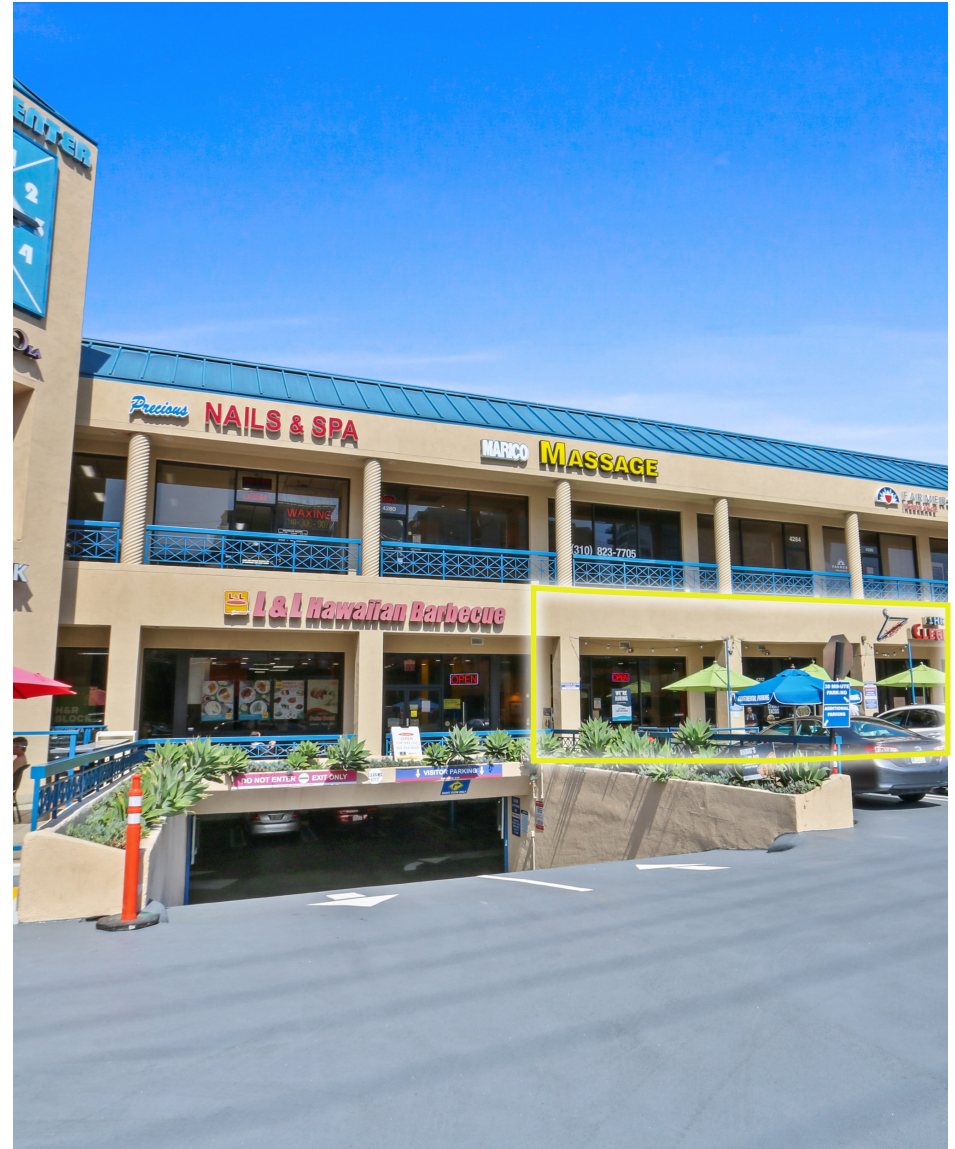
Entrance to subterranean parking