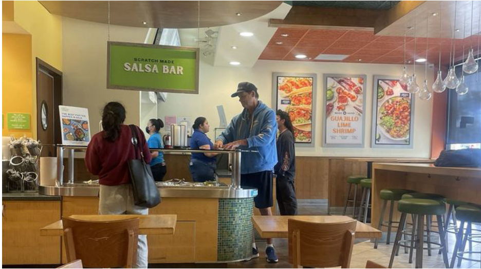
2nd gen. restaurant interior