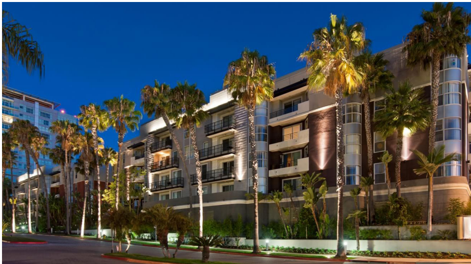
The Westerly on Lincoln