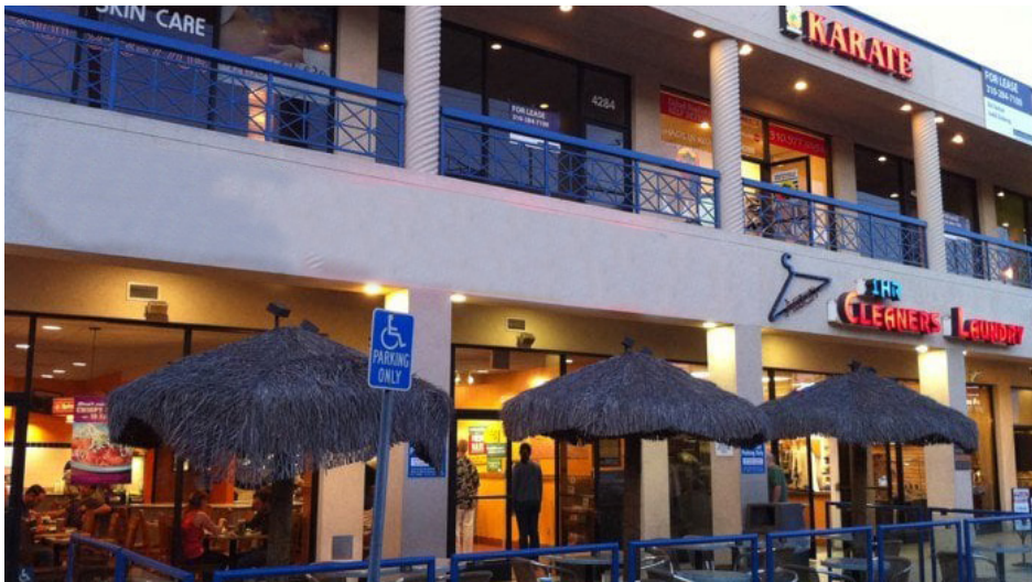
2nd gen. restaurant patio