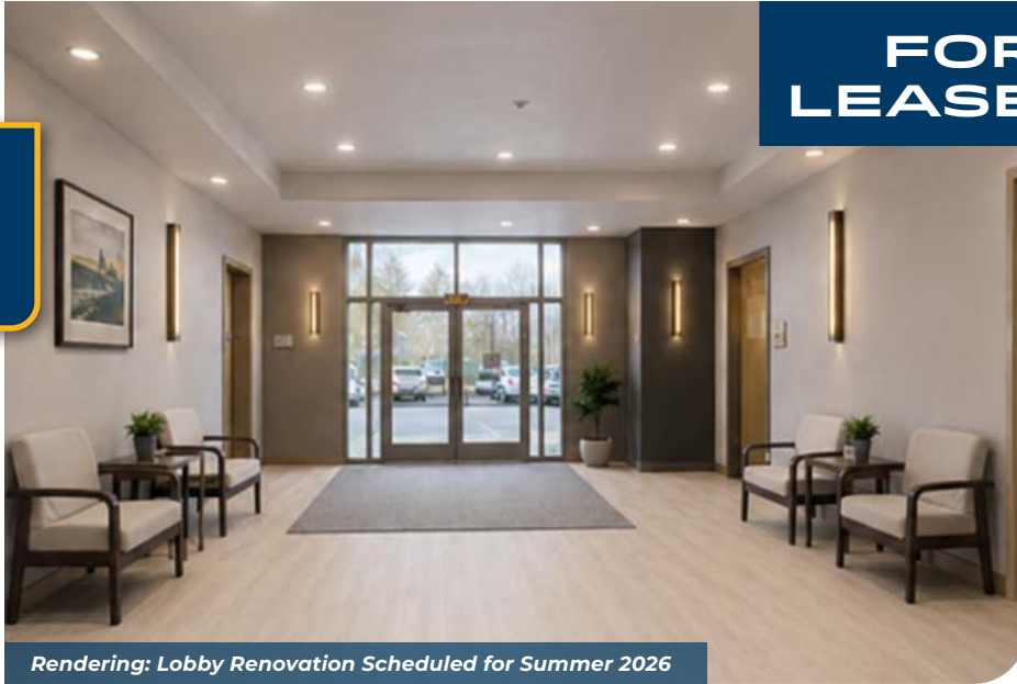
Rendering: Lobby Renovation Scheduled for Summer 2026