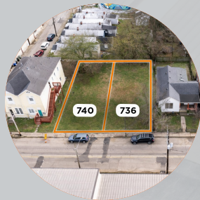
MULTIPLE ADJACENT LOTS