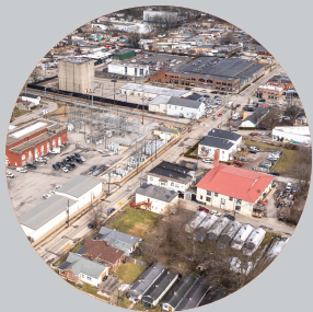
MINUTES FROM NOLI AND DOWNTOWN