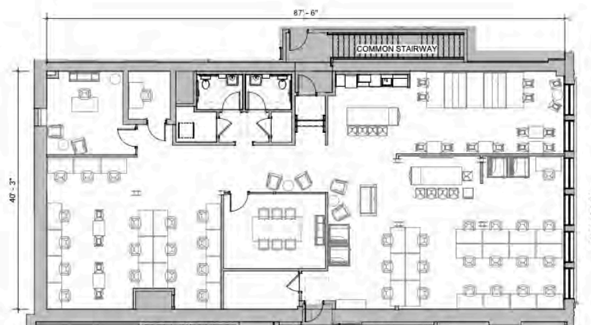
FLOOR PLAN · NOT TO SCALE