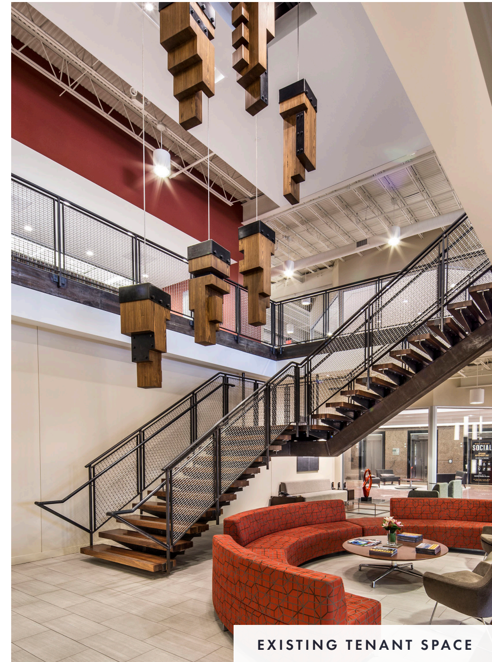
EXISTING TENANT SPACE