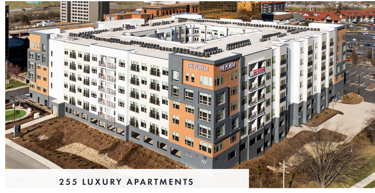
255 LUXURY APARTMENTS