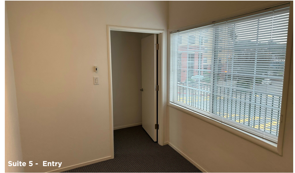
Suite 5 - Entry