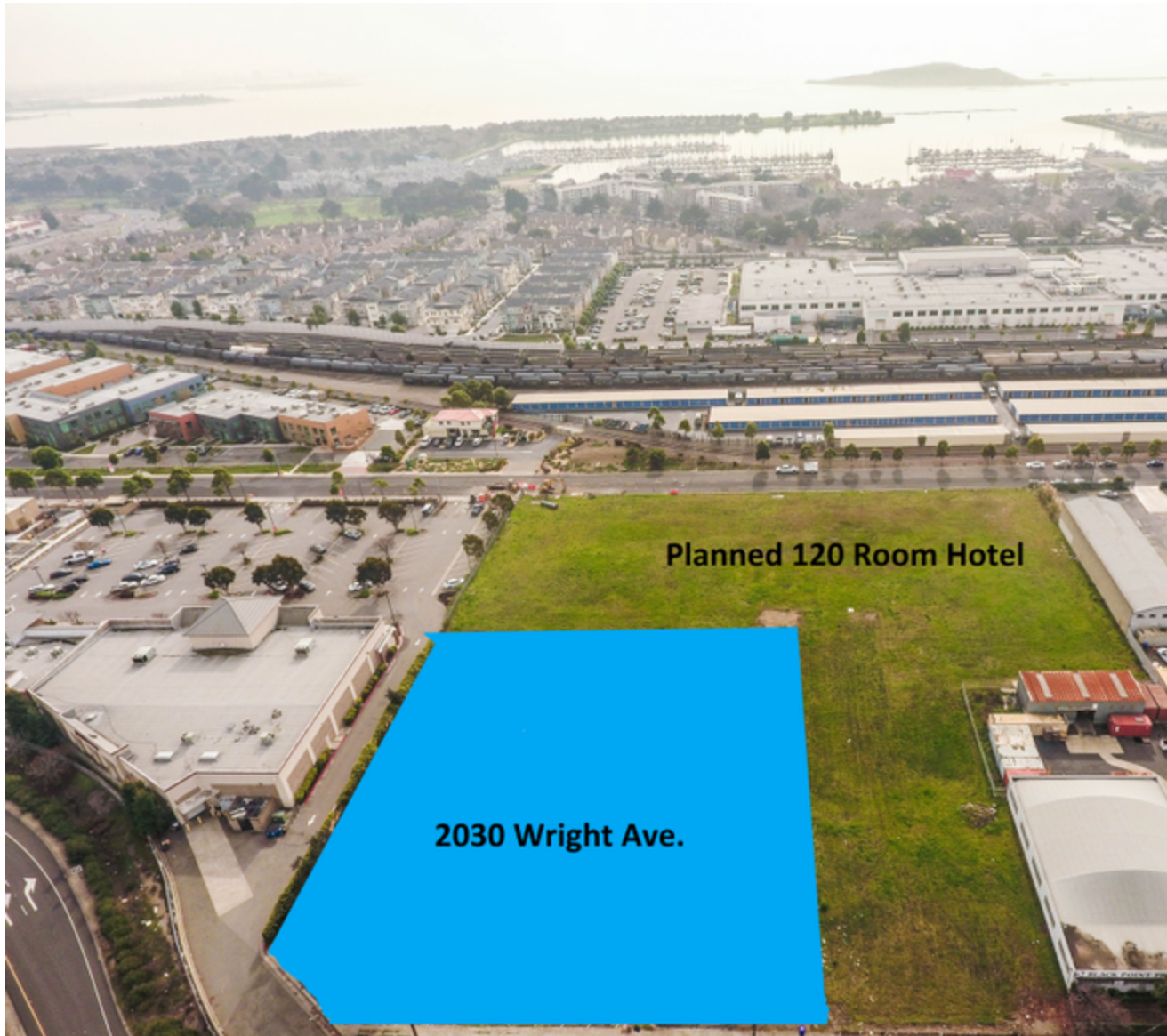
View to South