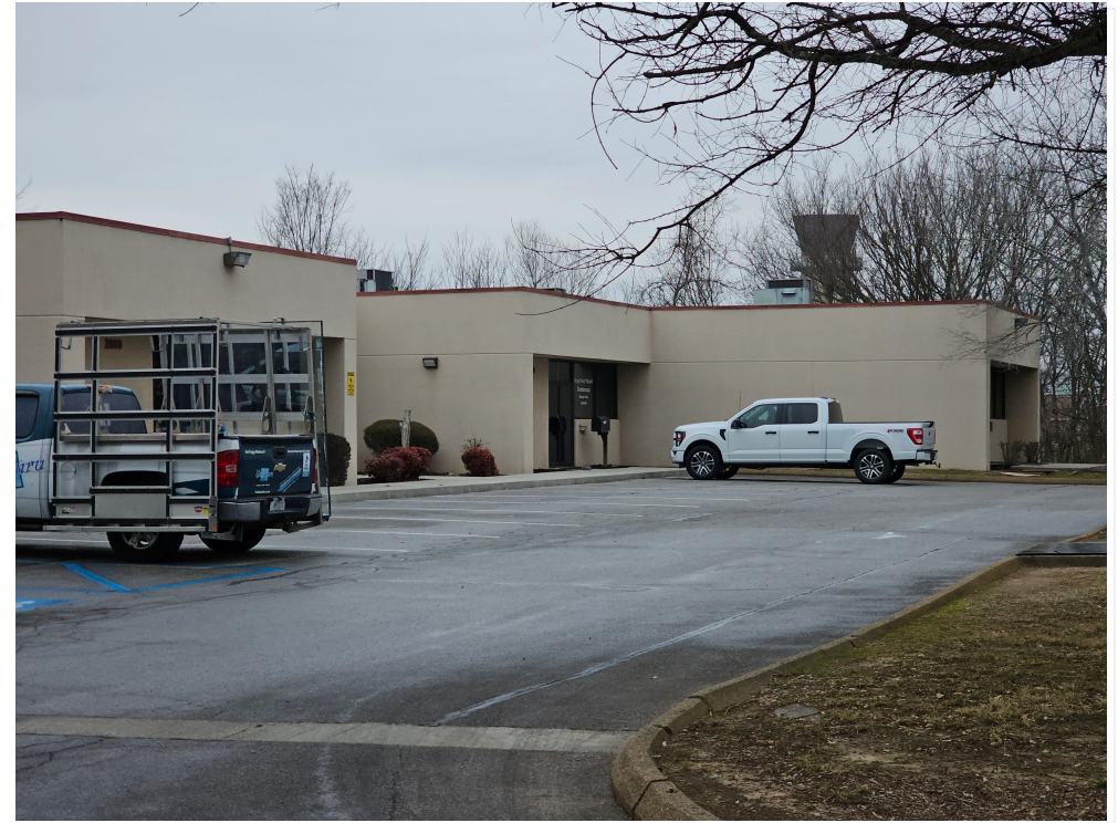
TN-Chattanooga - 115-117 Nowlin Ln_FLYER_Page_1