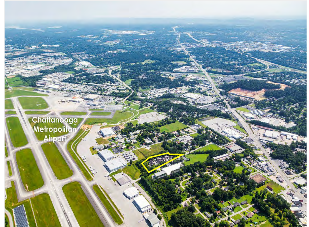
Airport and Hwy Proximity