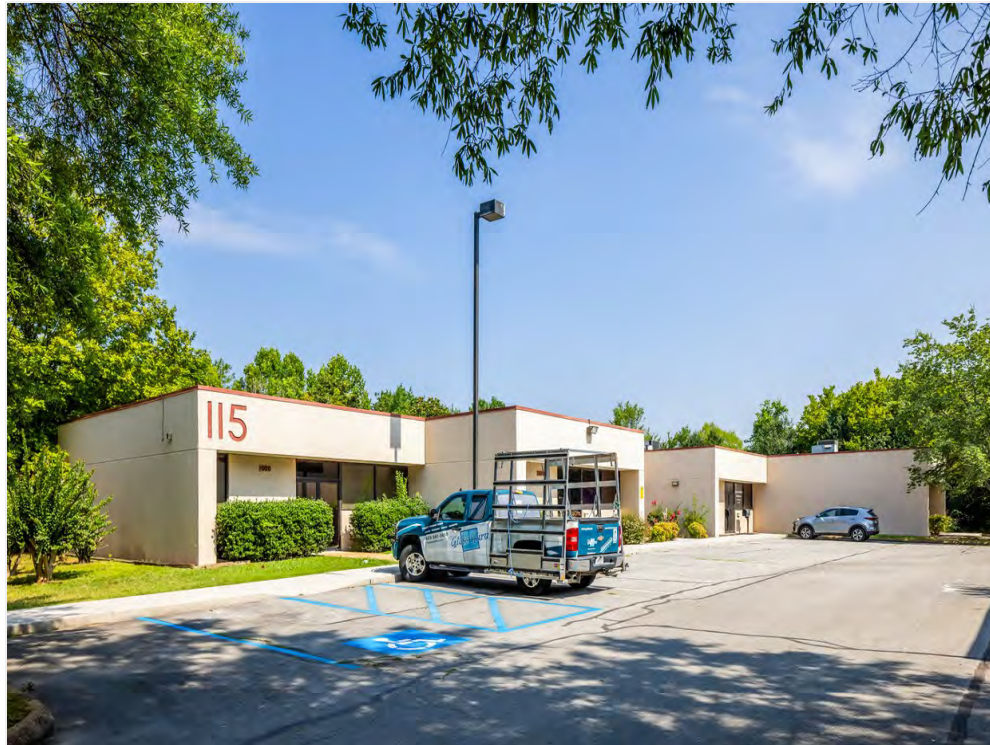
115 Nowlin Ln