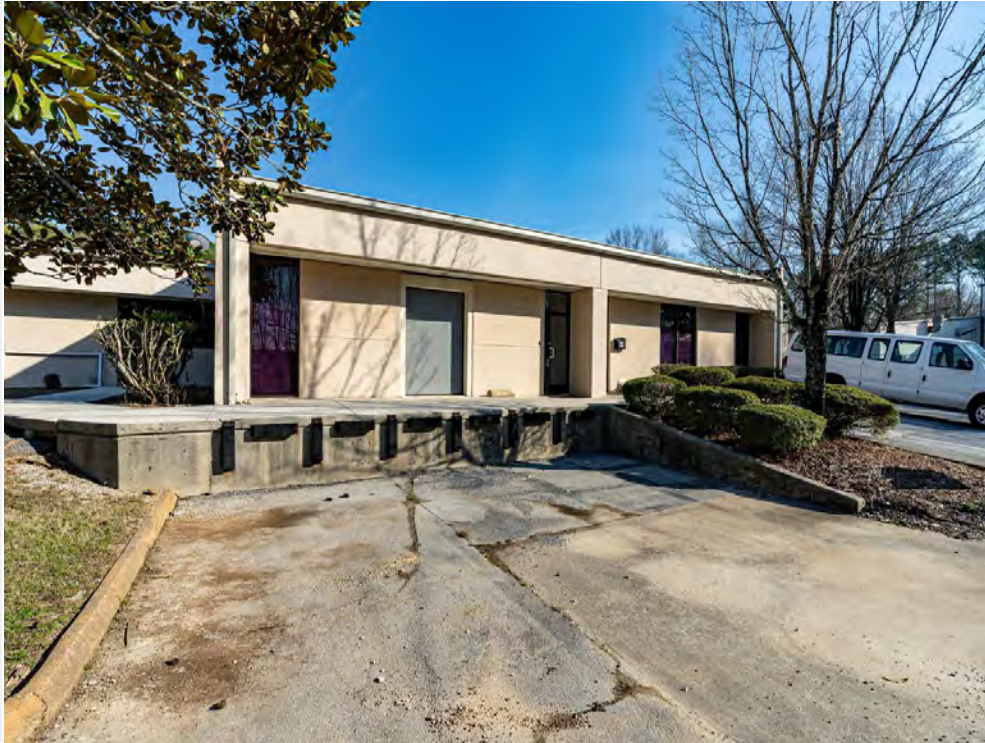
Dedicated Dock High Door 115 Nowlin Lane