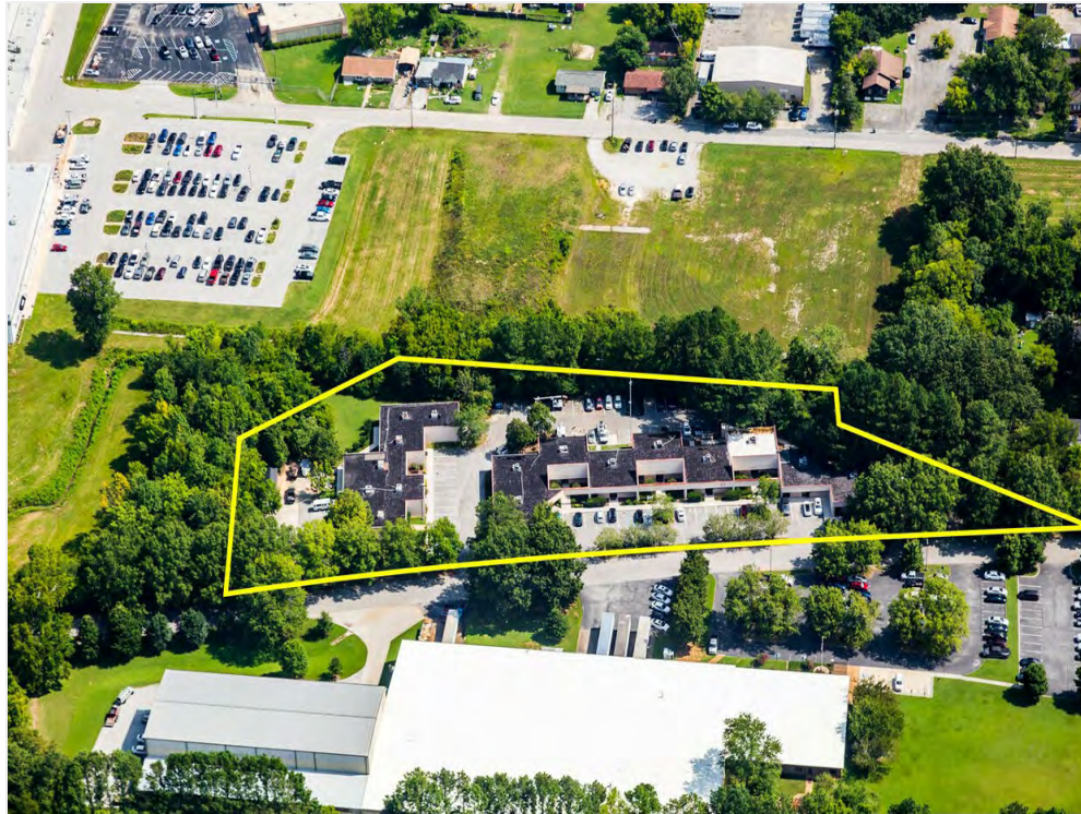
Air Park Centre - Office Park - Outline