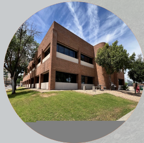
Class A Office