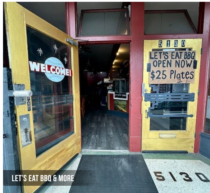
LET'S EAT BBQ & MORE