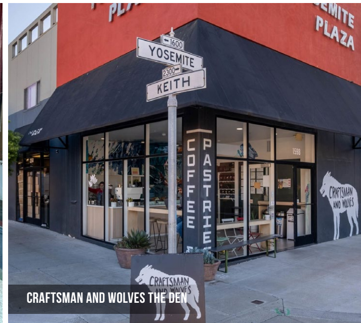
CRAFTSMAN AND WOLVES THE DEN