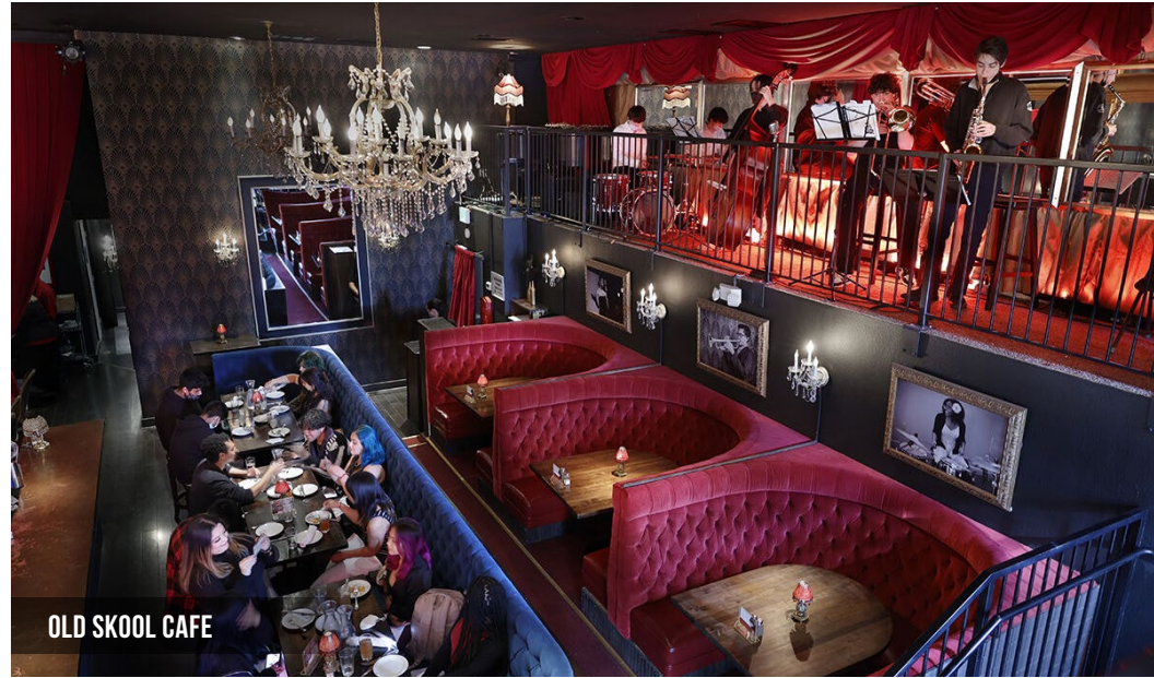
OLD SKOOL CAFE