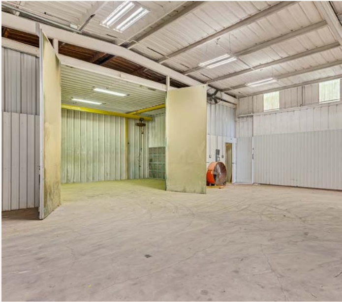
SUITE K - INTERIOR PAINT BOOTH