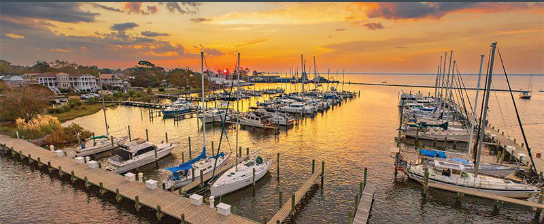
Sunset at the harbor of Oriental, "The Sailing Capital of NC"