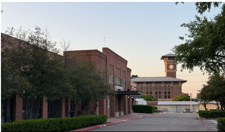
Walking Distance to Hotel Vin