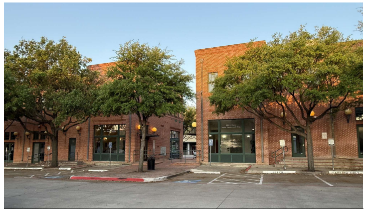
603 & 611 South Main Street