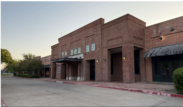
Entrance to building