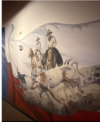
Hallway Wall Mural