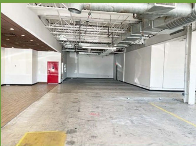
Entrance to Back