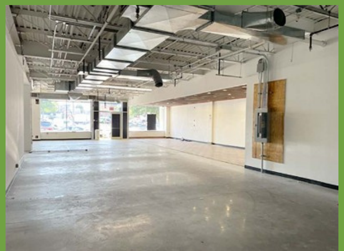
Back to Right