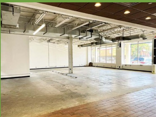
Back to Left