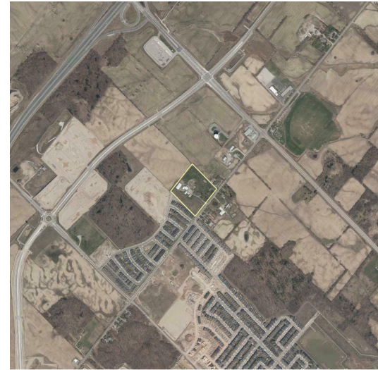
NOT A PLAN OF SURVEY. Boundary may not line up w