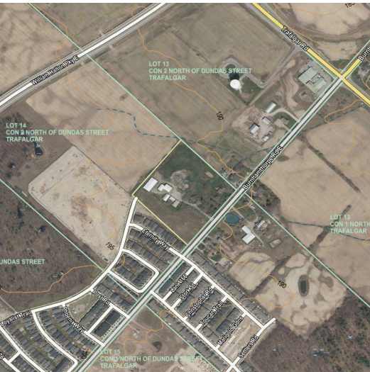
NOT A PLAN OF SURVEY. Boundary may not line up w