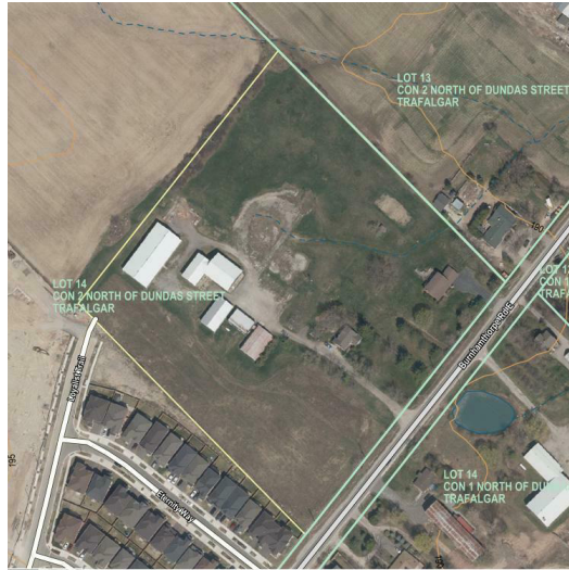
NOT A PLAN OF SURVEY. Boundary may not line up w