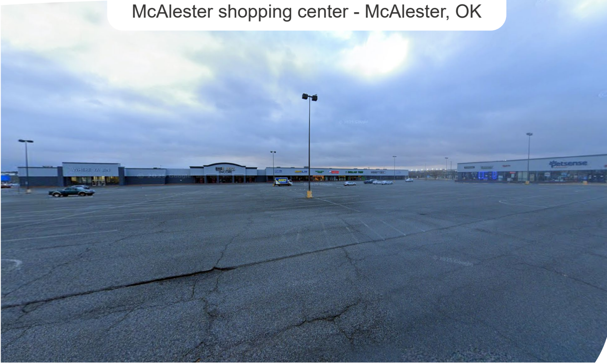
McAlester shopping center - McAlester, OK

330.856.7792 leasing@rossdev.net www.rossdev.net