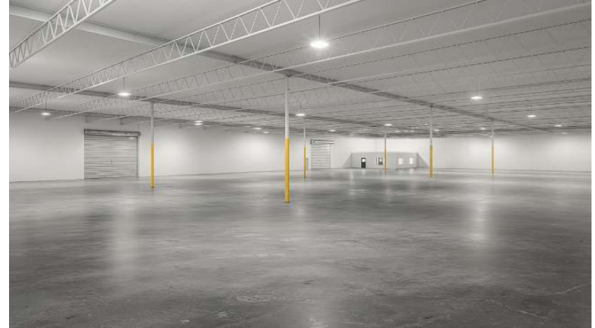
Whitebox warehouse - open bays, painted columns