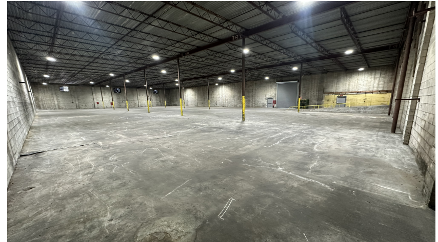
Existing condition - dock & grade-level loading