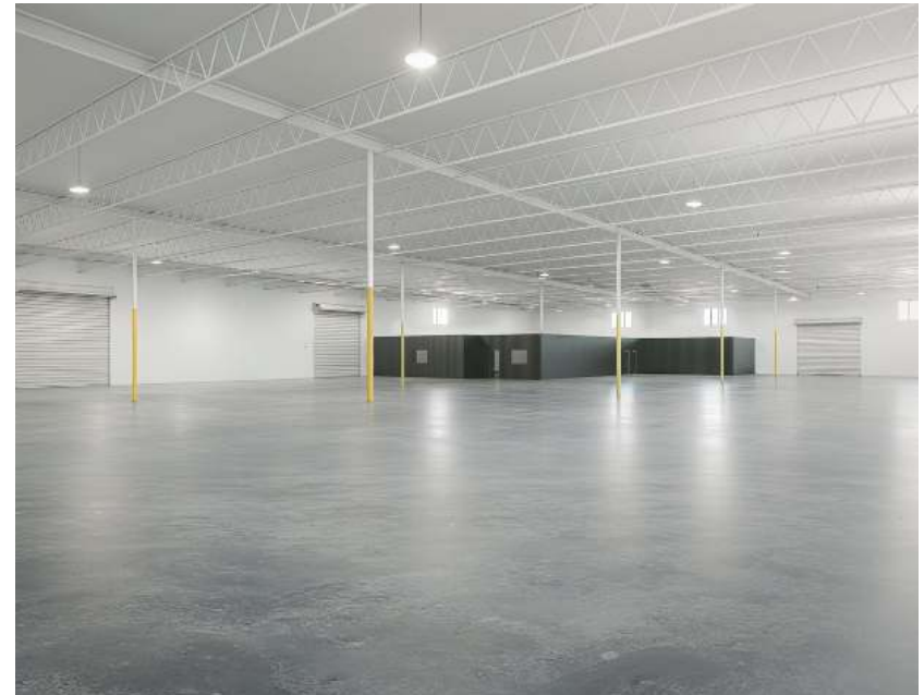
Whitebox warehouse — spec make-ready