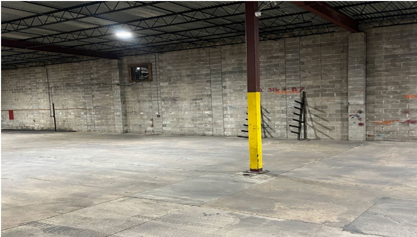
Existing condition - masonry warehouse