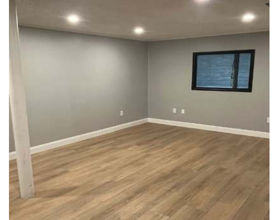
Recessed lighting & natural light