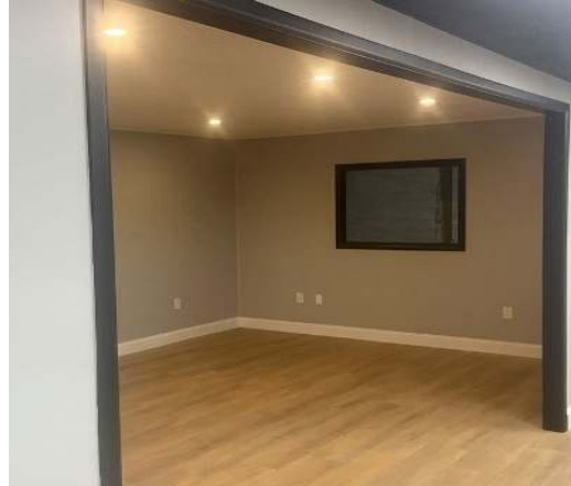
Renovated office — LVP flooring