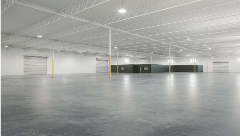
Whitebox warehouse - refinished, clear-span