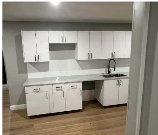
Kitchenette & break area