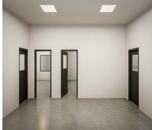
Reception / vestibule