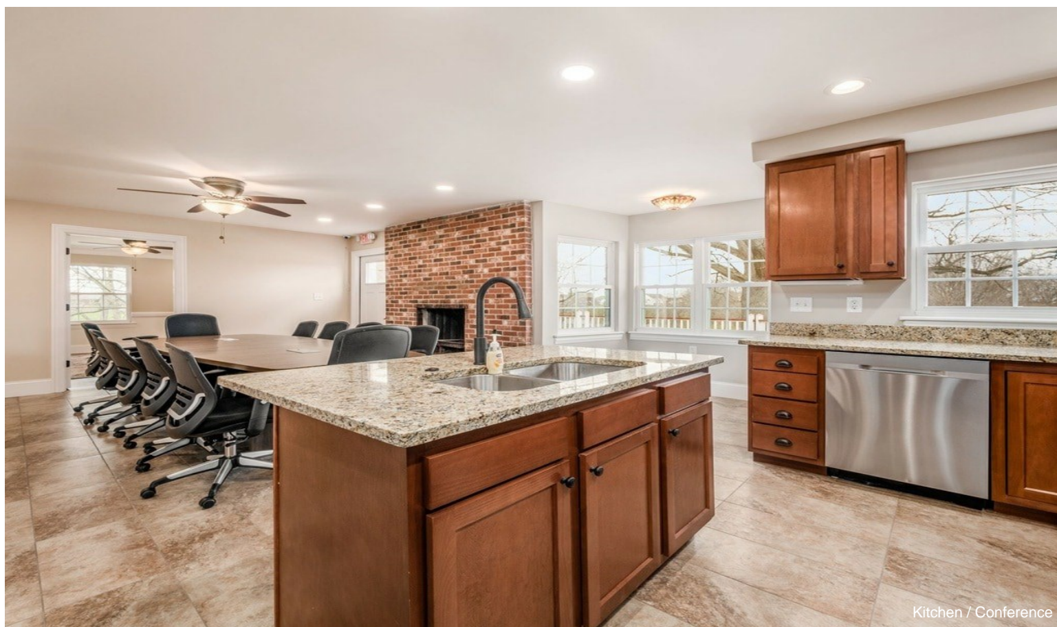
Kitchen / Conference