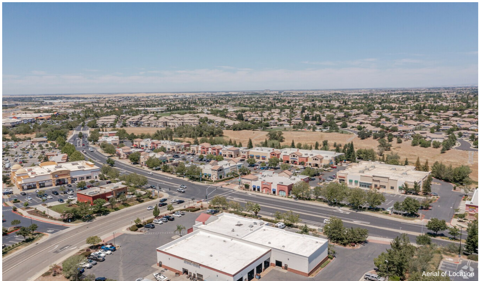
Aerial of Location